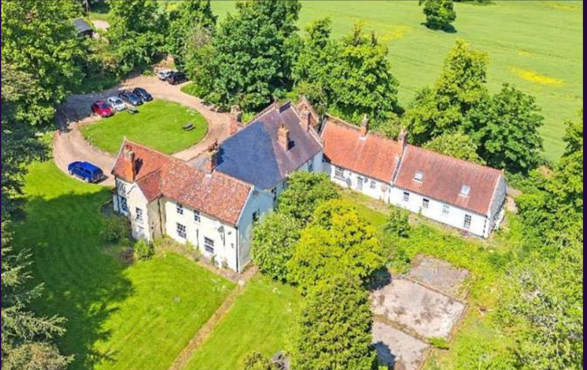
The Old Rectory, Church Lane, Claydon, Ipswich, Suffolk, IP6 0EQ