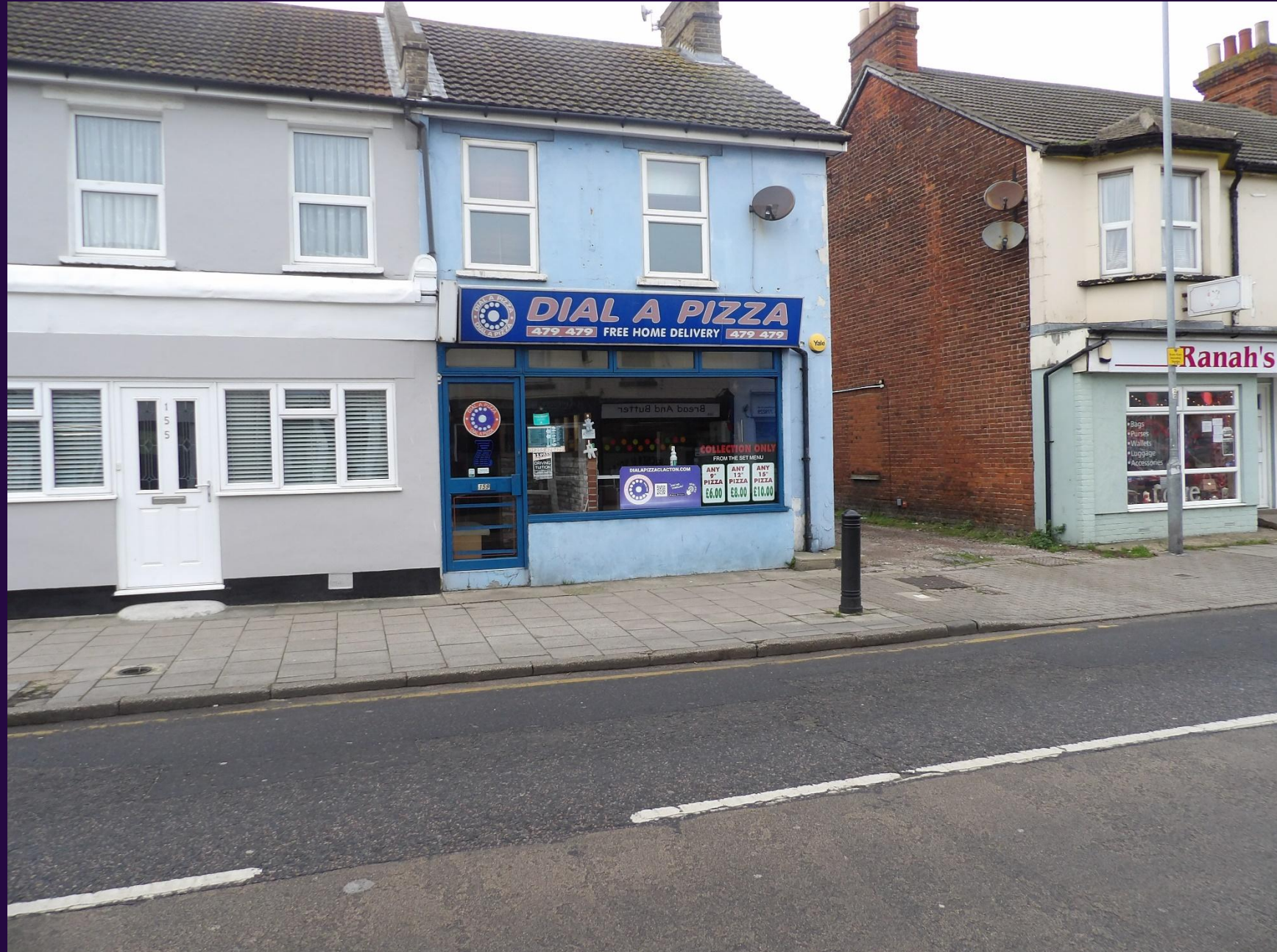
159 Old Road, Clacton on Sea, Essex, CO15 3AU