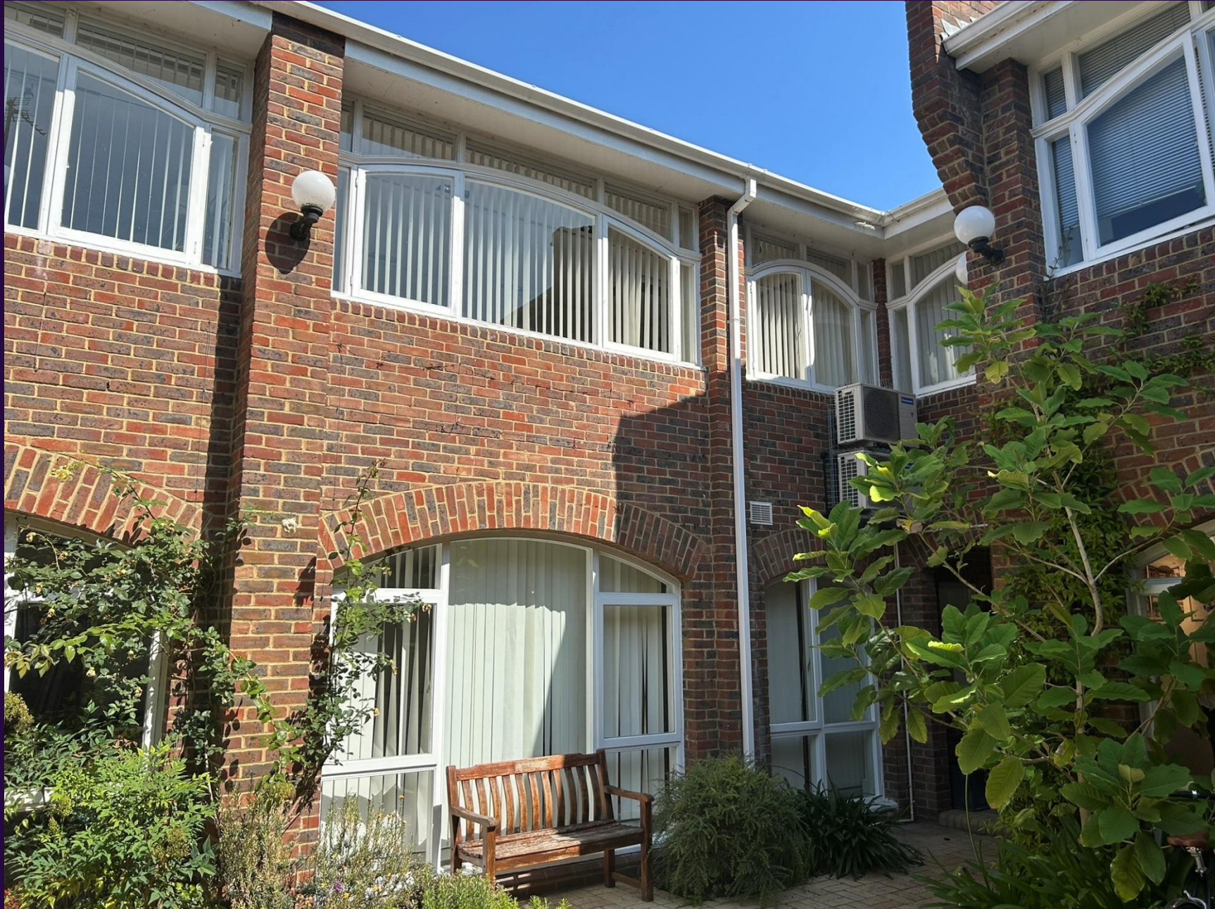
2 Bramber Court, Bramber Road, West Kensington, London W14 9PW